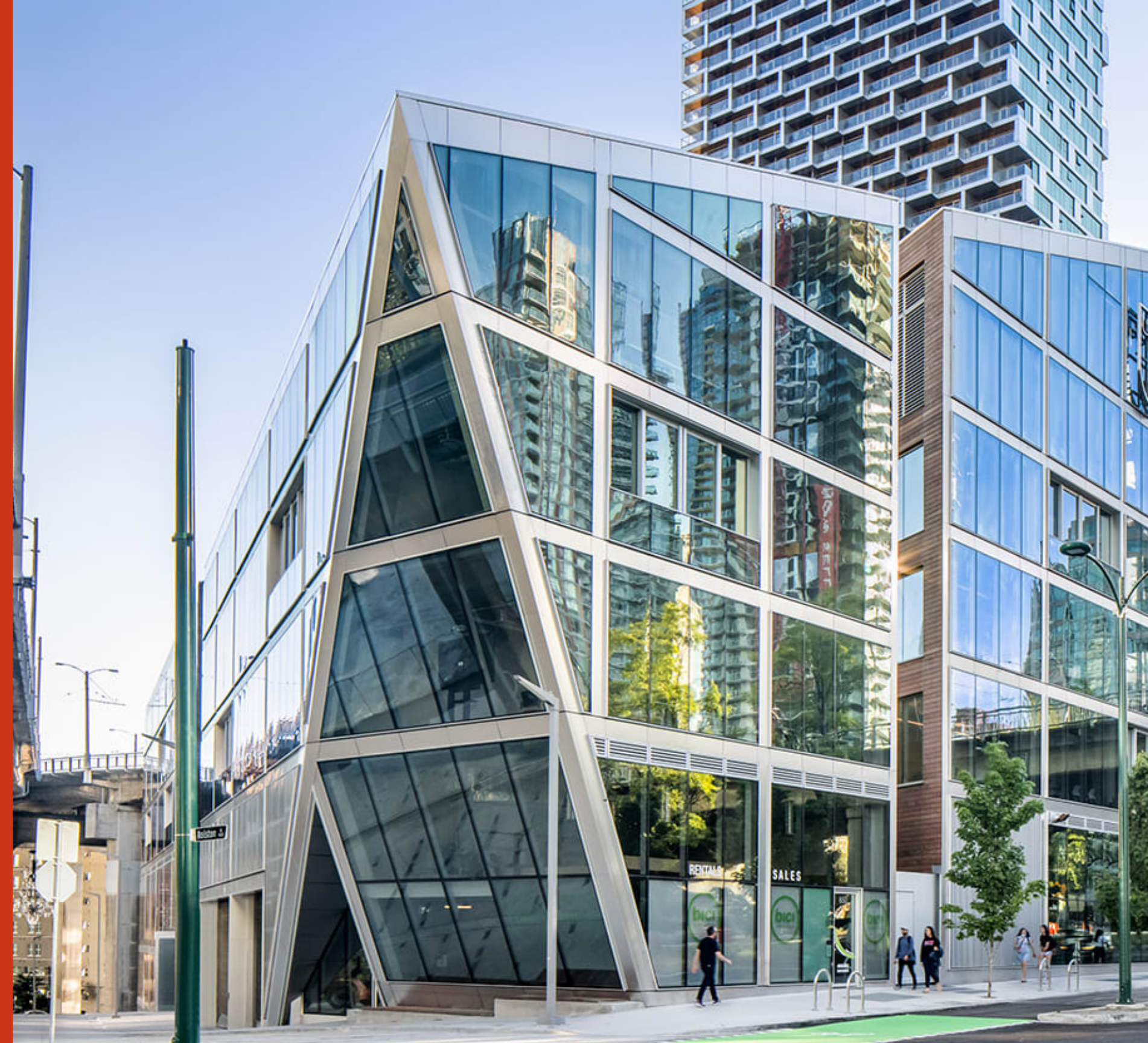
University Canada West*