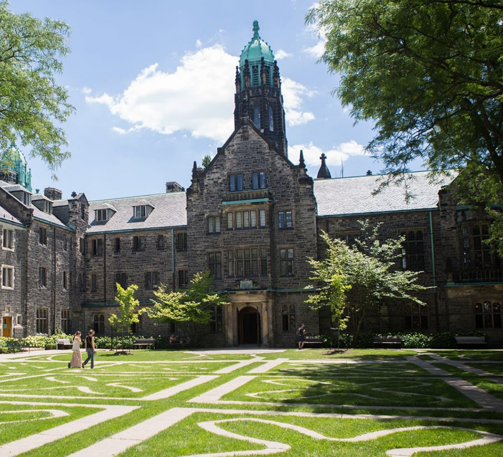
University of Toronto*